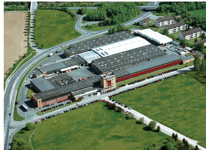
LOROWERK in Bad Gandersheim

Reliability, quality and technological expertise at the highest level has made the "family firm of LORO" a trusted partner for all rainwater drainage issues for designers, architects, contractors and construction industry partners for over 50 years.