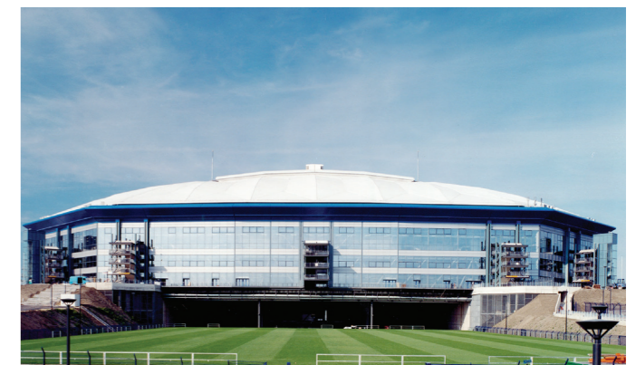
Stadia and social construction